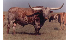
SR EMPEROR'S BRENDA