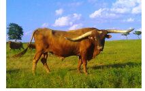
Diamond W 9811