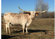
M Arrow Fashion Trend